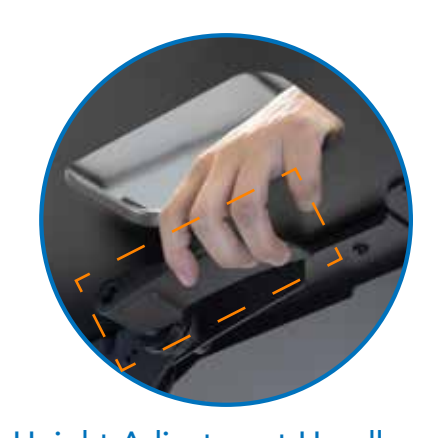
Height Adjustment Handle