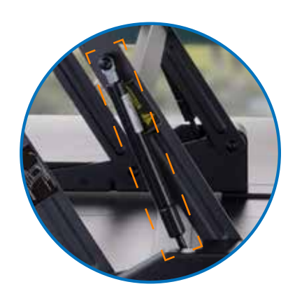
Easy Gas Spring lift