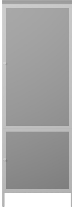
(A) Cabinet x1