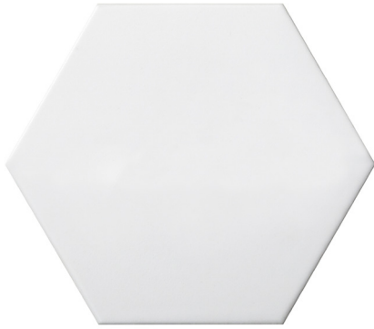
White Hexagon Smooth