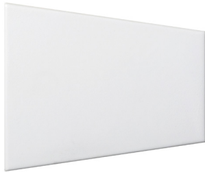
White Wedge Smooth