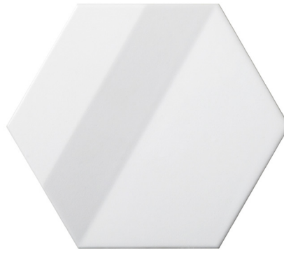
White Hexagon 3D