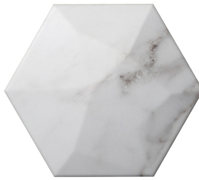
Calacatta Hexagon Smooth