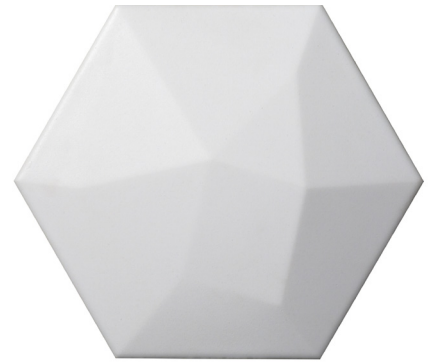
White Hexagon High