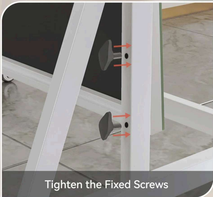
Tighten the Fixed Screws