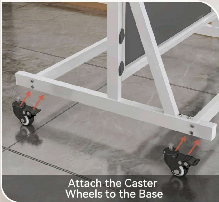
Attach the Caster Wheels to the Base