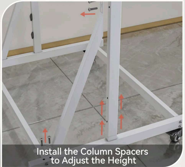
Install the Column Spacers to Adjust the Height