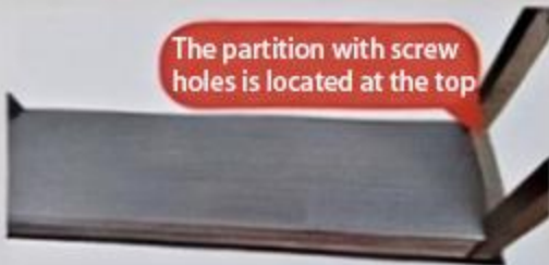
7、 Put all the middle partitions in

The partition with screw holes is located at the top