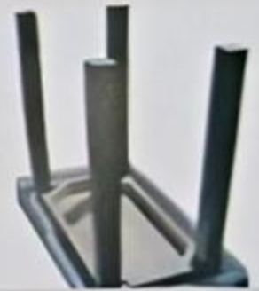
6、 Complete the installation of shoe changing stool legs

The partition with screw holes is located at the top