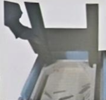
5、 Install the other three legs in the same way