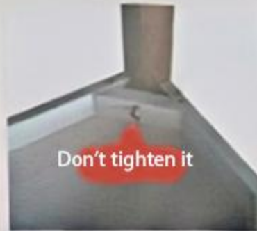
4、 Slightly fix with screws

Pay attention to distinguishing between the left and right sides