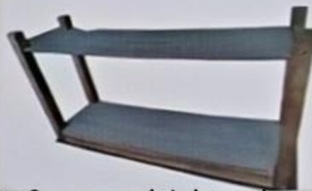
8、 Secure and tighten the partition with screw holes using screws