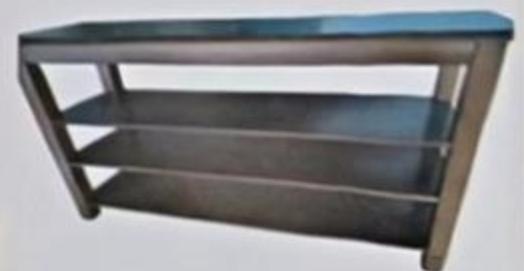
12、 Complete the installation of the shoe changing stool