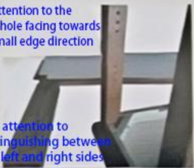
3、 Place the stool legs in the installation position

Pay attention to the small hole facing towards the small edge direction