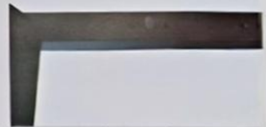
9、 Insert the wooden tip into the hole and lower the partition