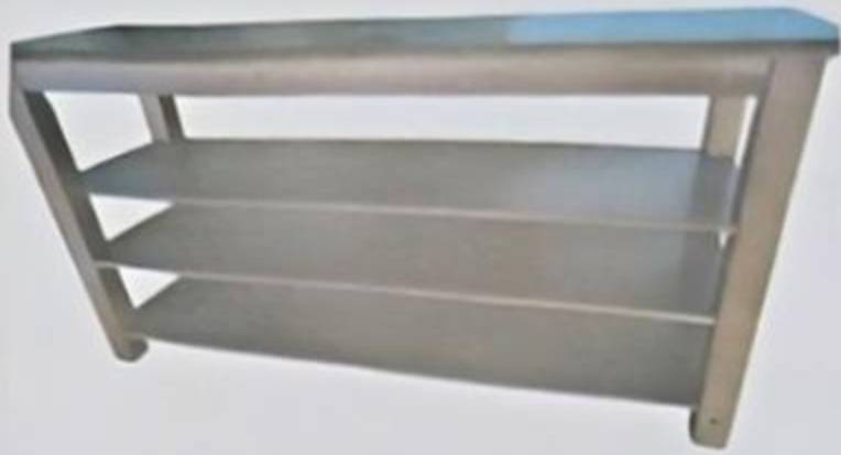
1、 Overall installation rendering of shoe changing stool completed