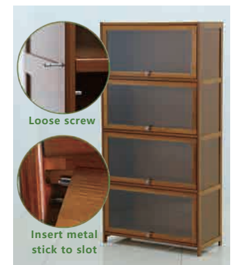
⑨ Install doors to the rack as picture shown.