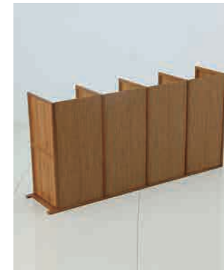
⑤ Insert Back Panels (d) to slot as picture shown.