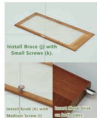
⑦ Install Doors (c), Braces (j), Knobs (h) and Metal Sticks (i) as picture shown.

© 2020-2023 by Pundarika LLC - MoNiBloom.com