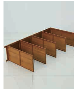
④ Secure Top Panel (e) with Large Screws (m).