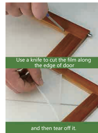
Use a knife to cut the film along the edge of door and then tear off it.