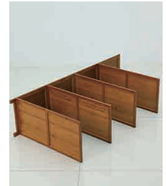
③ Secure Frame (a) and Panels (f) with Large Screws (m) as picture shown.