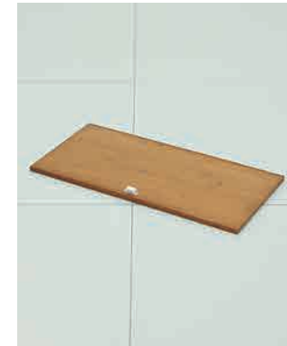
② Position Panel (f) and Stopper (g) as picture shown. Secure with Small Screws (k).