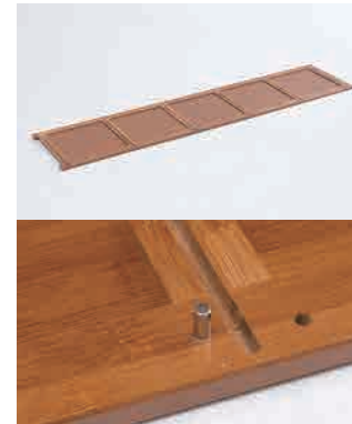
① Insert Metal Stick (i) in the pre-drilled hole on Frames (a)(b).

The assembly instructions may vary depending on the number of tiers.