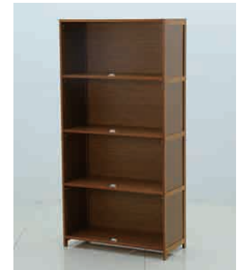
⑥ Position and secure Frame (b) with Large Screws (m)

© 2020-2023 by Pundarika LLC - MoNiBloom.com