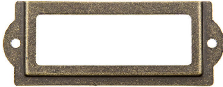
Antique Brass - RL021866