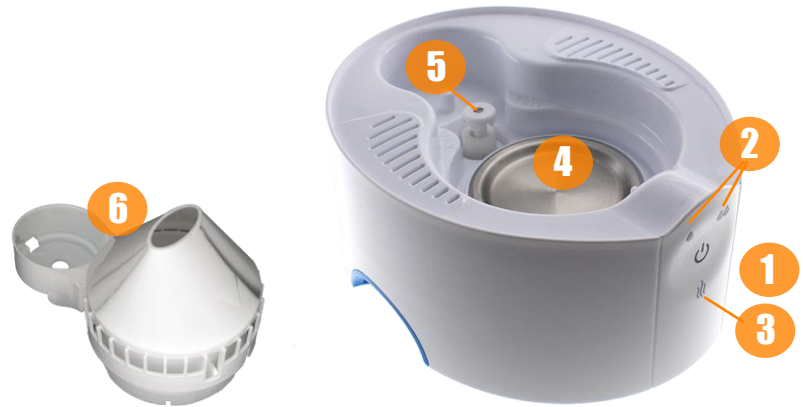
Fig. 2 (Water Tank)