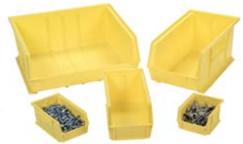
Optional Hook-On® Bins and dividers are available from Durham