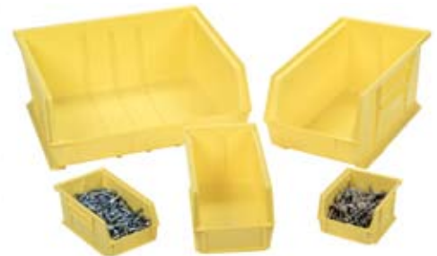
Optional Hook-On® Bins and dividers are available from Durham