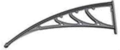
③: Bracket (x3)