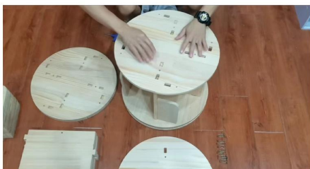
4.INSTALL A D BOARD