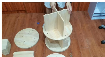
8.REPEAT THE FIRST, FOURTH, AND FIFTH STEPS TO INSTALL THE SECOND, THIRD, AND FOURTH LAYERS.INSTALL B PANEL ON TOP OF THE FOURTH FLOOR