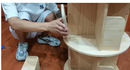
9.INSTALL E-PLATES ON EACH LAYER IN TURN, FOUR IN EACH LAYER