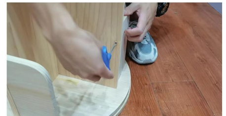
3.SCREW ON THE SIDE OF E-PLATE