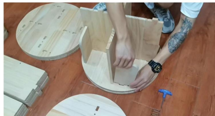
2.INSTALL FOUR E-PLATES