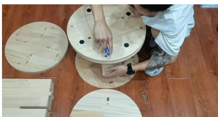
7.SCREW ON THE BOTTOM OF E-PLATE