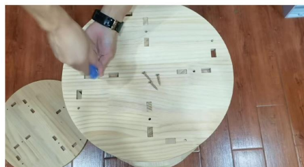
5.THE SCREW HOLE CORRESPONDS TO THE C PLATE AND THE D PLATE, SCREW IT IN