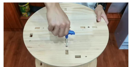
11.SCREW ON THE BOTTOM OF EACH E-PLATE FOR SECONDARY FIXATION