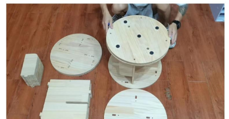
6.BOTTOM UP, FIND THE CORRESPONDING SCREW HOLE BETWEEN THE E-PLATE