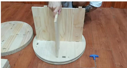
1.TWO C-PLATES ARE FITTED WITH A-PLATES