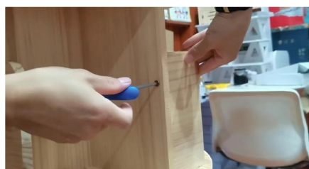
10.SCREW ON THE SIDE OF EACH E-PLATE