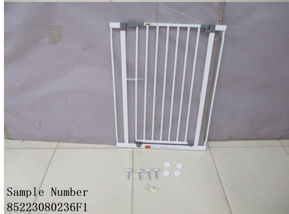
Sample Number 85223080236F1