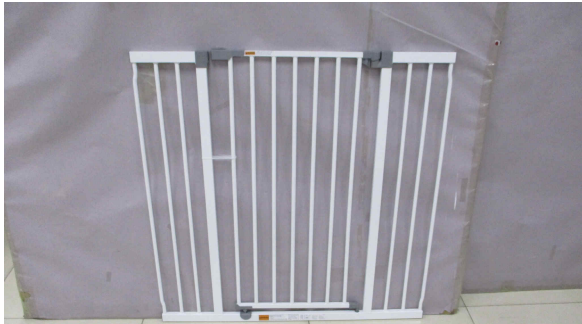
Sample Number 85223080236G1