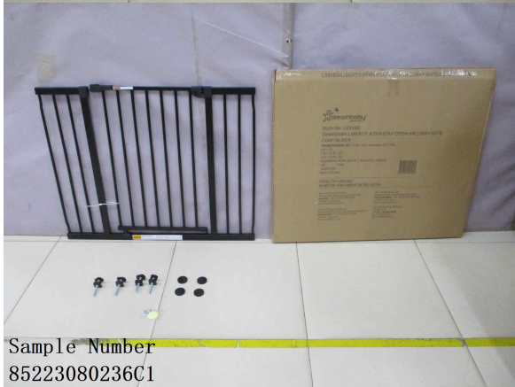
Sample Number 85223080236C1