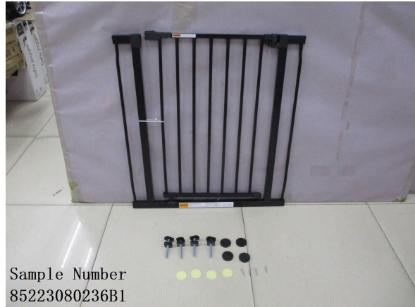
Sample Number 85223080236B1