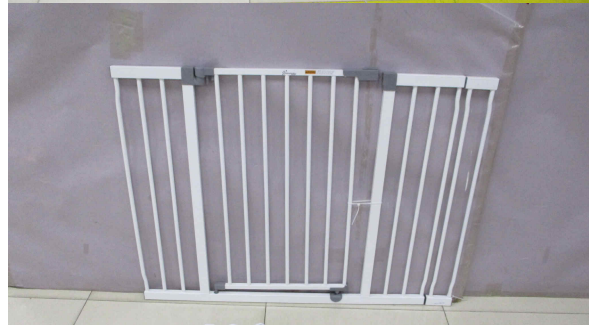
Sample Number 85223080236J1