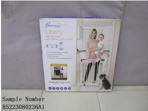
Sample Number 85223080236A1