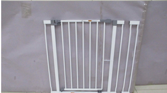
Sample Number 85223080236I1