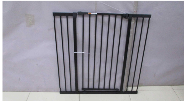
Sample Number 85223080236H1