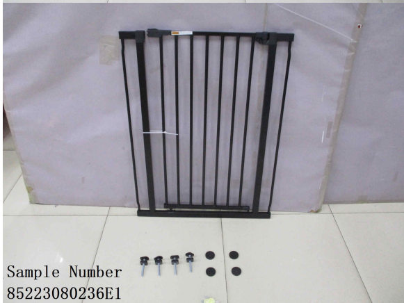
Sample Number 85223080236E1