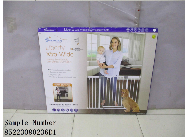
Sample Number 85223080236D1