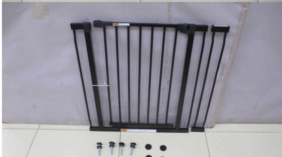
Sample Number 85223080236K1