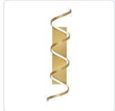
WS93736-AN Antique Brass

A looping radiant line casts light across space in a continuous helical path. The Synergy series is characterized by the rolled rectangular extrusion, which emits soft light through the silicon opal lens. Configured in both linear and ring arrangements, the arcing aluminum allows the curated finishes to be visible at every angle.