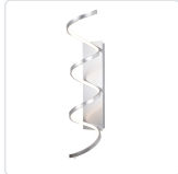
WS93736-AS Antique Silver