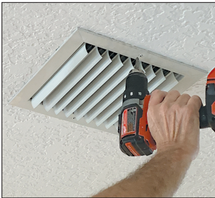
1. Remove old vent.