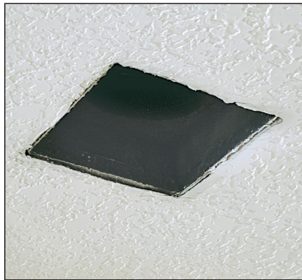
2. Repair any damage to ceiling and vent box.