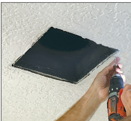
4. Drill pilot holes with 3/32" drill bit where you marked. You should not drill all the way through the metal part of the vent box.