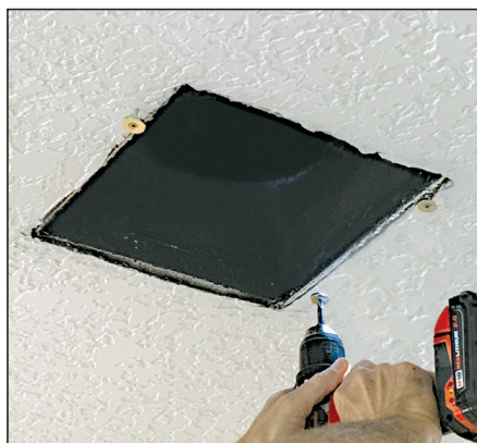
5. Screw in magnets part way after they (self tap) into the metal part of the vent box.