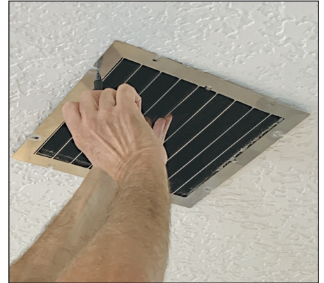
3. Mark for magnet holes. There will be 4 to 6 magnets to be installed. Magnets can be installed in any of the 4 corner slots.