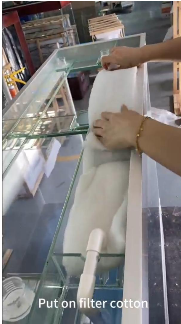
Put on filter cotton