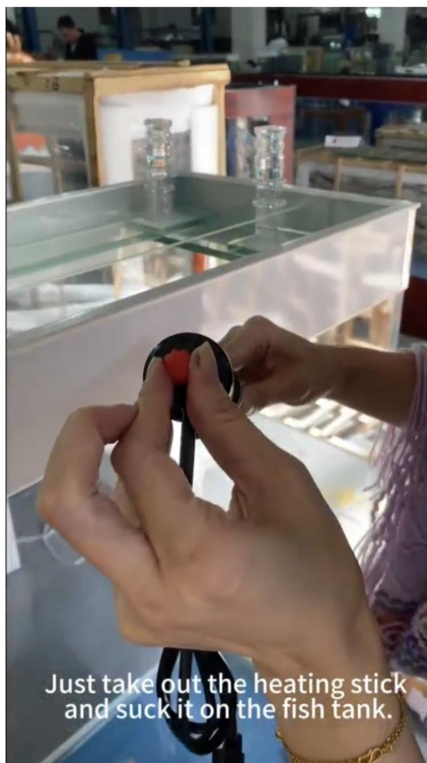
Just take out the heating stick and suck it on the fish tank.