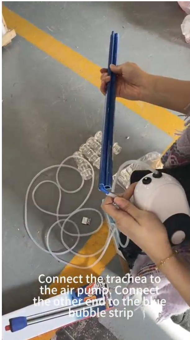
Connect the trachea to the air pump. Connect the other end to the blue bubble strip