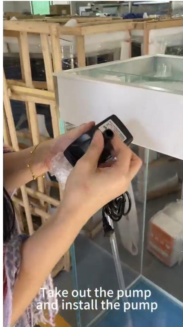
Take out the pump and install the pump