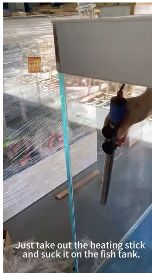
Just take out the heating stick and suck it on the fish tank.