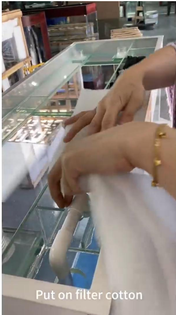
Put on filter cotton