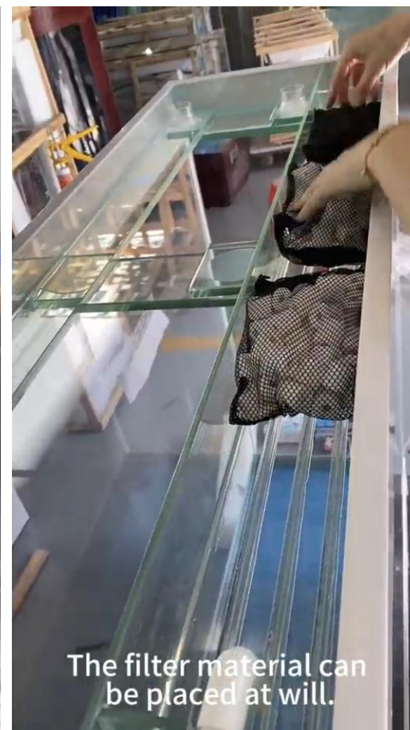
The filter material can be placed at will.