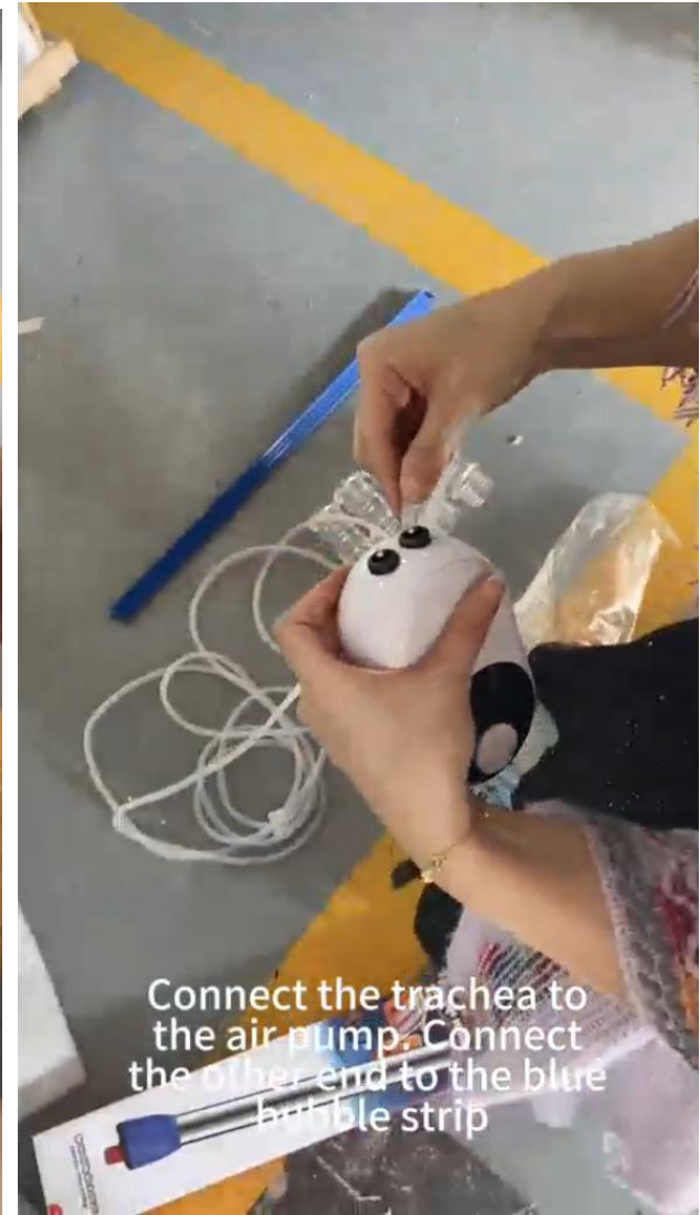
Connect the trachea to the air pump. Connect the other end to the blue bubble strip