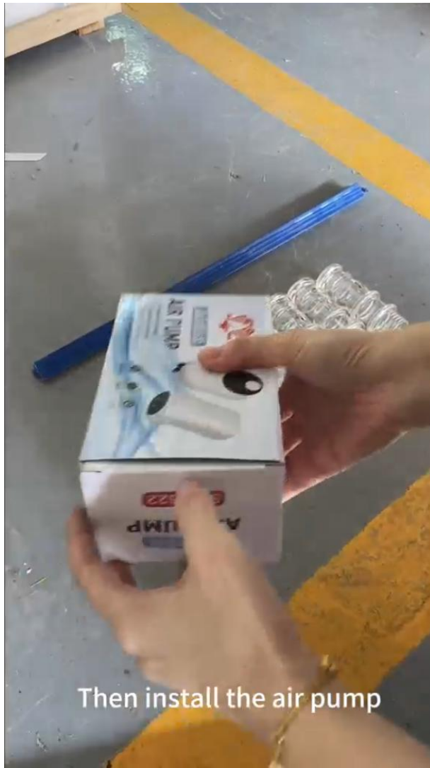
Then install the air pump