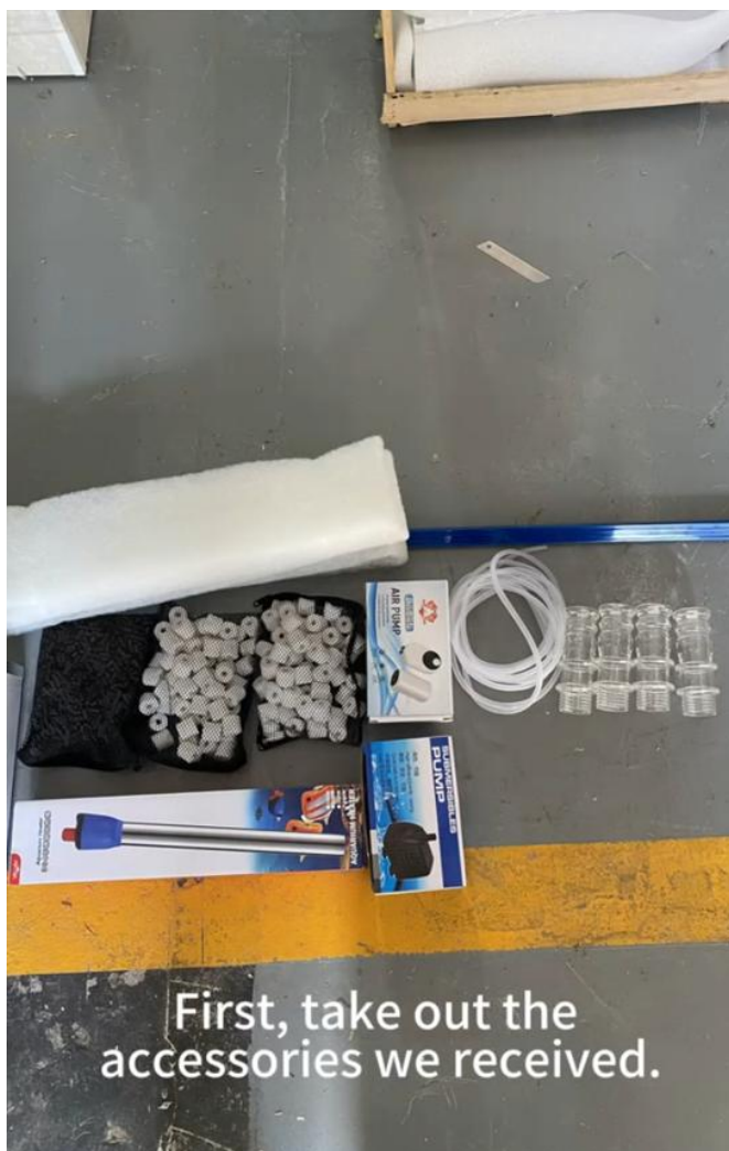
First, take out the accessories we received.