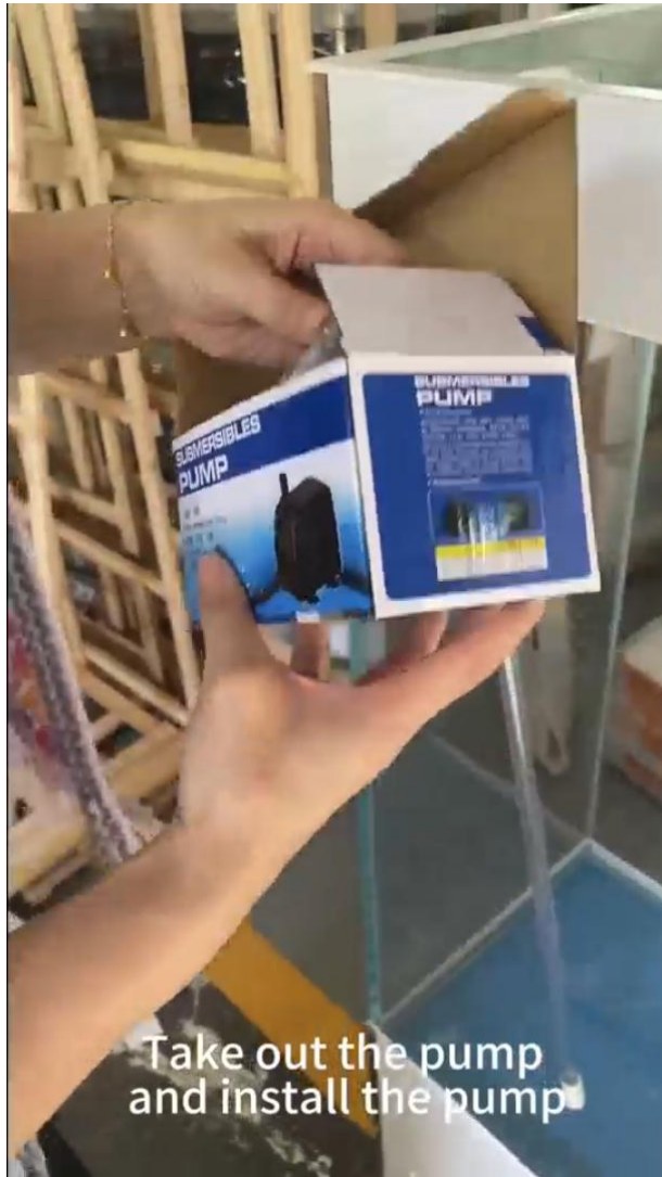
Take out the pump and install the pump