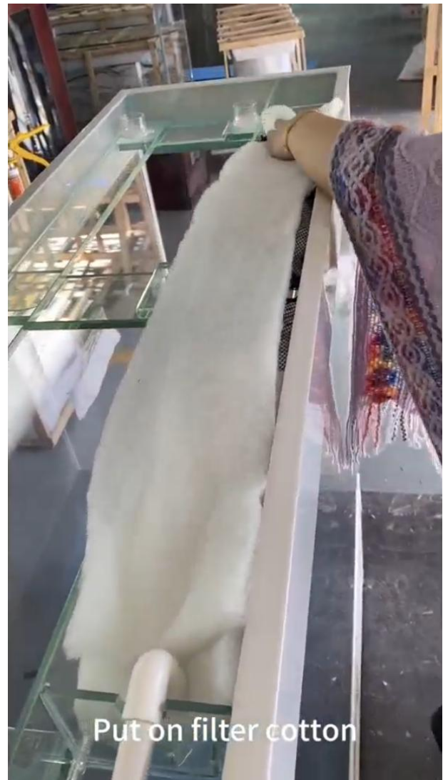
Put on filter cotton