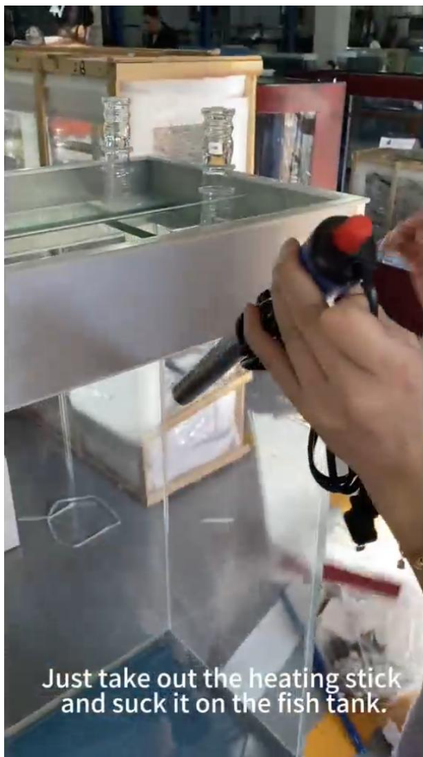
Just take out the heating stick and suck it on the fish tank.