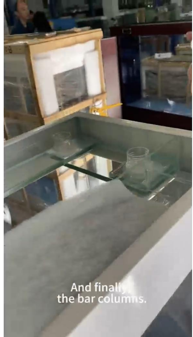
And finally, the bar columns.