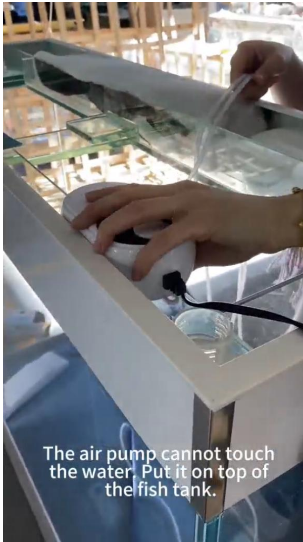
The air pump cannot touch the water. Put it on top of the fish tank.