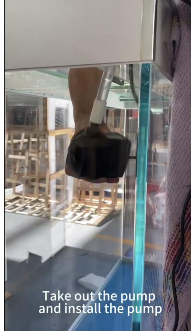
Take out the pump and install the pump