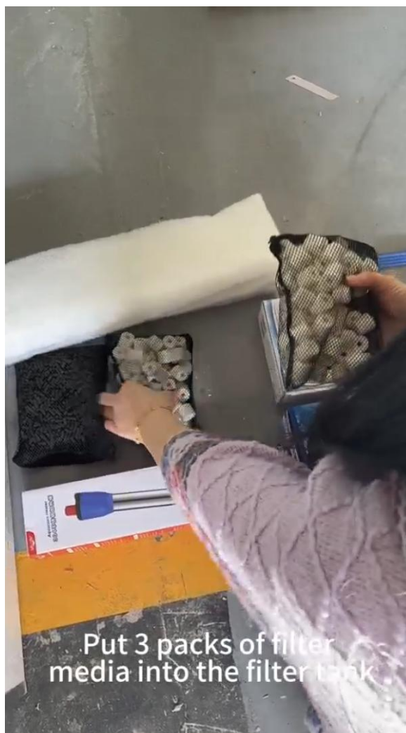
Put 3 packs of filter media into the filter tank