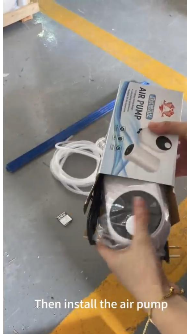
Then install the air pump