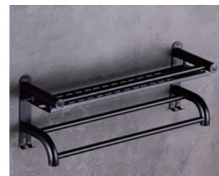
6. Leave it for 24 hours before using