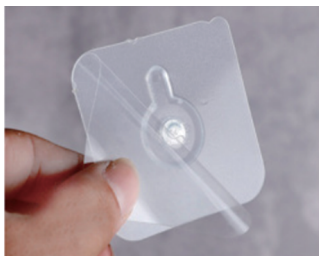
2. Tear off protective film