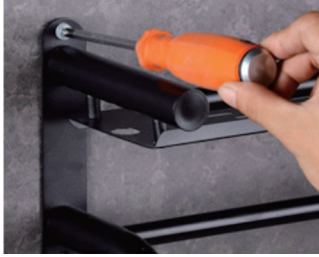
5. Fix the screw