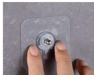
4. Extrude air