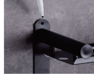
2. Mark the position