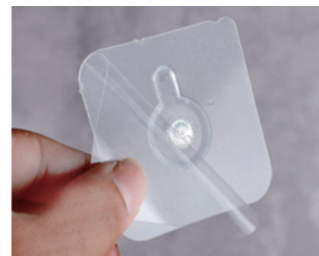
2. Tear off protective film