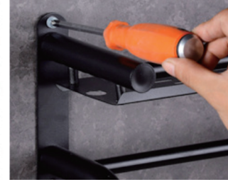
5. Fix the screw