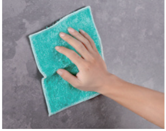
1. Clean the surface