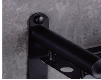
6. Add the cap