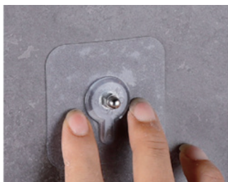
4. Extrude air