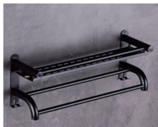
6. Leave it for 24 hours before using