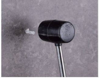
4. Pound the plastic accessories