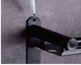
2. Mark the position