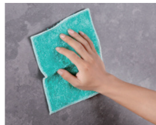
1. Clean the surface