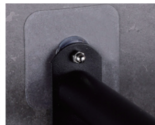
5. Hang the rack and fix the screw