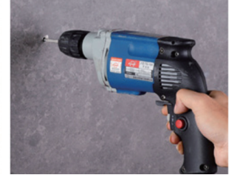
3. Drill holes