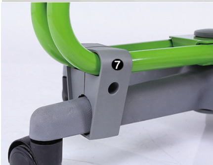
Optional Base Lock