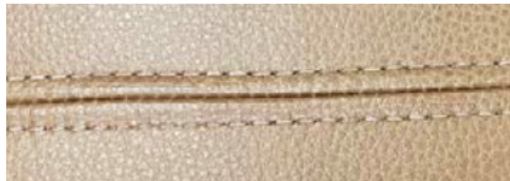
Slight Shade Variation