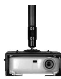
PJF2 with Clamp-Style Universal Adapter