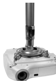
PJF2 with Spider® Universal Adapter