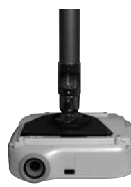
PJF2 with Projector-Specific Adapter Plate*