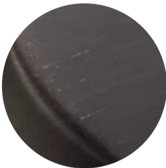
Venetian Bronze - 112, 11P