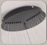
Installation of sloping ceiling