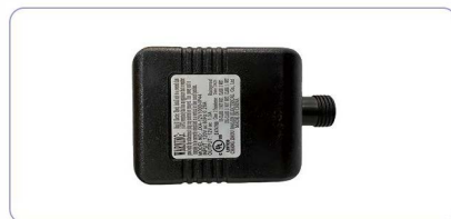
04 Transformer for Pump