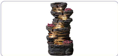
01 Water Fountain