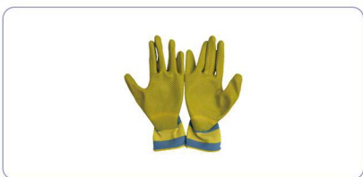
05 Gardening Glove