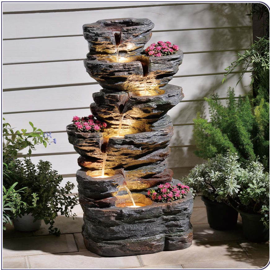
Version - V 2.0