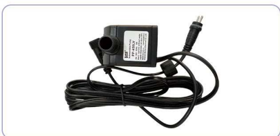
03 Fountain Water Pump