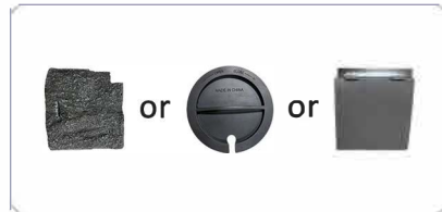
02 Fountain Back Panel