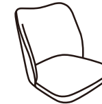
Chair Seat *1