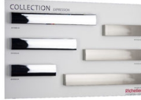
Expression Board - 98208