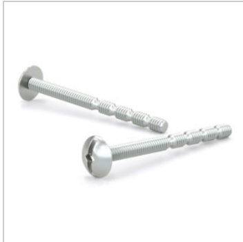
Breakaway Machine Screw, Large Truss Head, Combined Quadrex Slot Drive, 8-32, Type B Point Product № 2905 Packaging format: Bag of 50 units