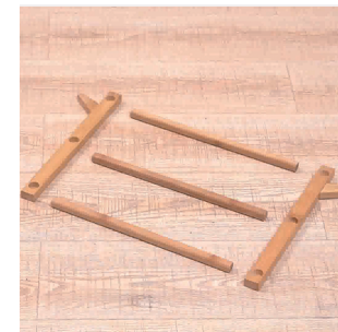
8 Connect Hooks (h) with Slats (g) on the pre-drilled holes.