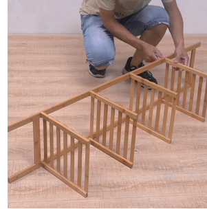
1 Secure Frame (a) and Small Panels (d) with Screws (j).

© 2020 - 2023 by Pundarika LLC - MoNiBloom.com