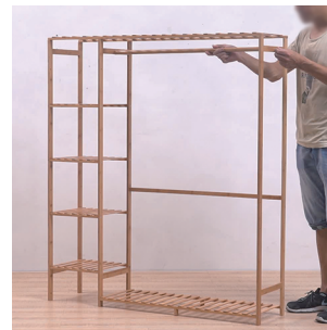
7 Secure Top Hanging Rod (f) and Frame (a) with Screws (j).