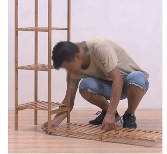
3 Secure Bottom Panel (c) and Legs (i) with Screws (j). Secure Bottom Panel (c) and Frame (a) with Screws (j).