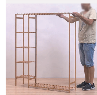
5 Secure Top Panel (b) with Screws (j).