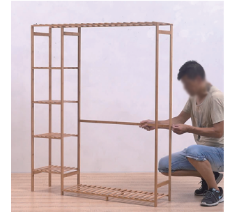
6 Secure Back Slat (e) with Screws (j) as picture shown.