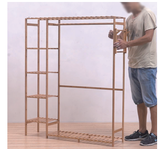
9 Install the completed Hooks on Frame (a) with Screws (j).