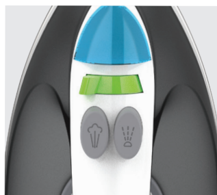
STEAM BURST & SPRAY MIST