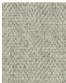
VD03 - SILVER