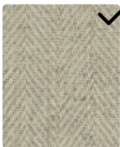
VD01 - BEIGE