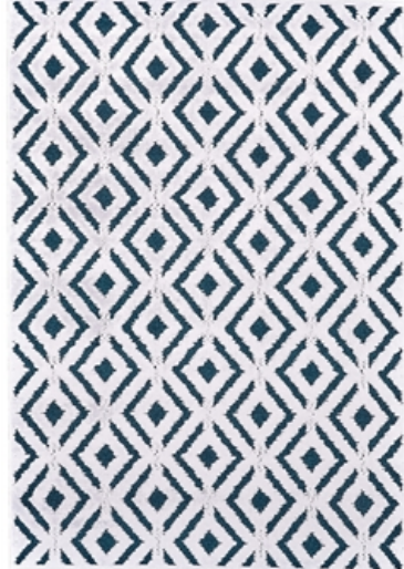
TEAL / WHITE