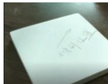
6. Then use 600# sanding paper at last.