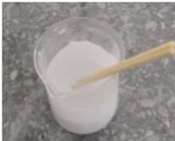
3. Stir that liquid material at 1 minute.