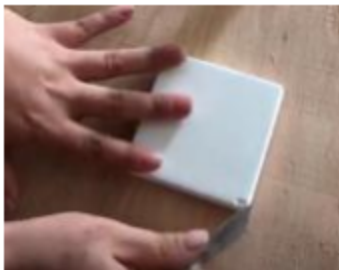
1. Use blade to clear off the damaged area.

Different with other materials such as marble, sintered stone, acrylic or other material, solid surface stone products can be repaired even if they were damaged, and some seemingly impossible damage such as cracks, missing angles etc. can be repaired by following repair steps as follows (There will be a color difference) :