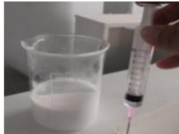
2. Mix liquid material with solidified agent.