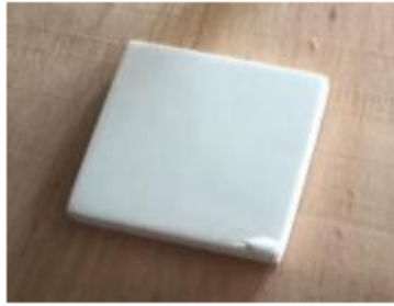
4. Pour that liquid material into the damaged area.