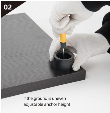
If the ground is uneven adjustable anchor height