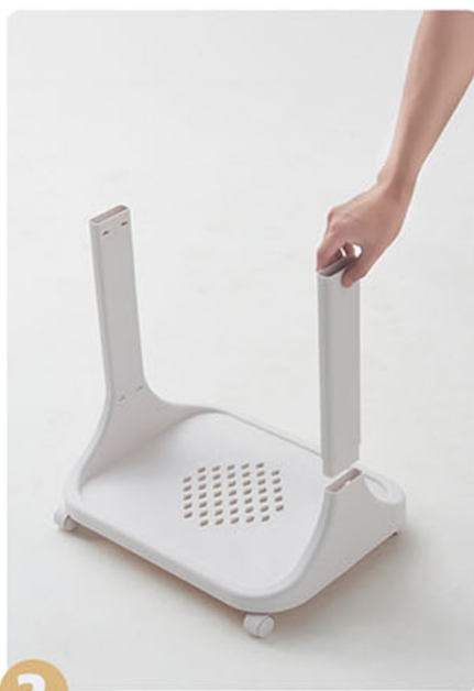
2 Storage basket support frame