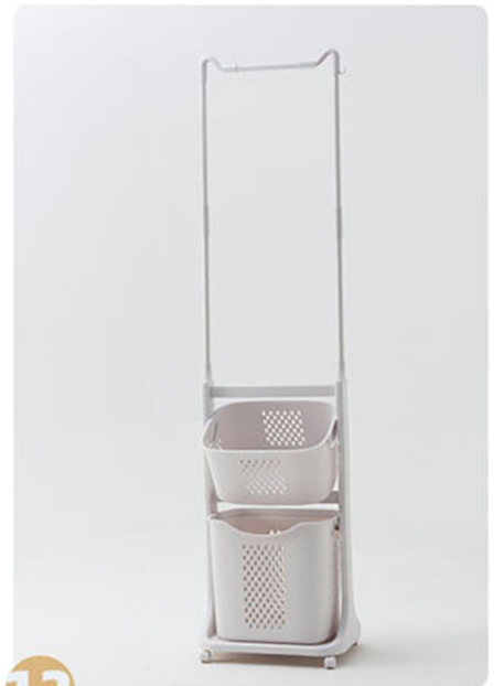
12 The installation is complete