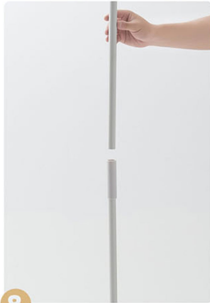
8 Install the support frame after installing the link tube