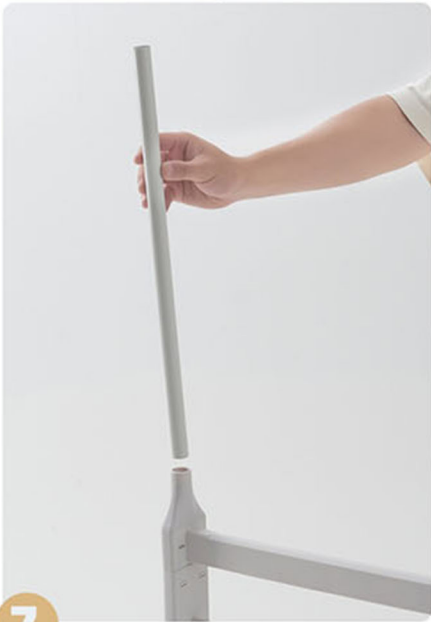
7 Mounting support frame