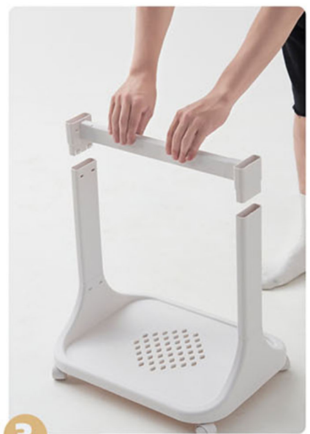
3 Install the cross bar