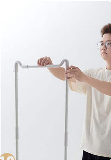
10 Secure the top support frame