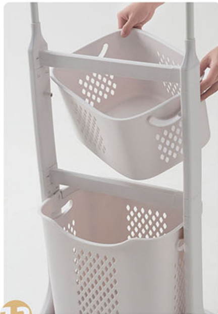
12 Install the storage basket