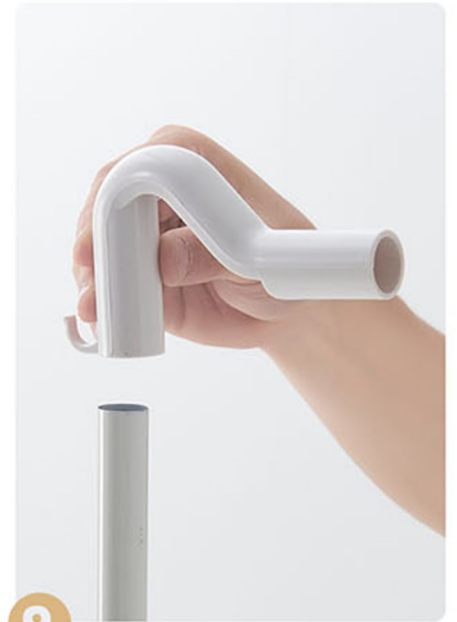
9 Install the top top joint