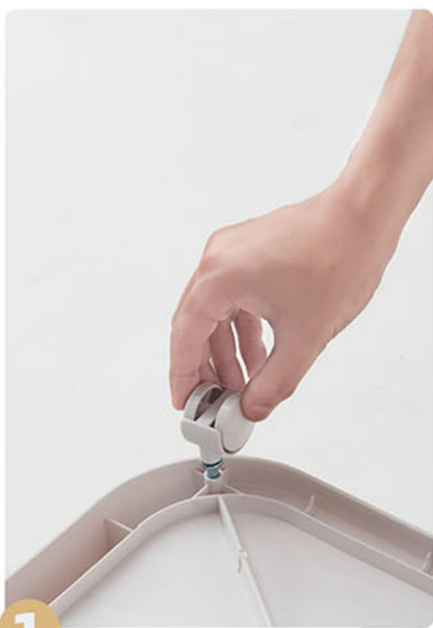
1 Bottom frame universal wheel assembly