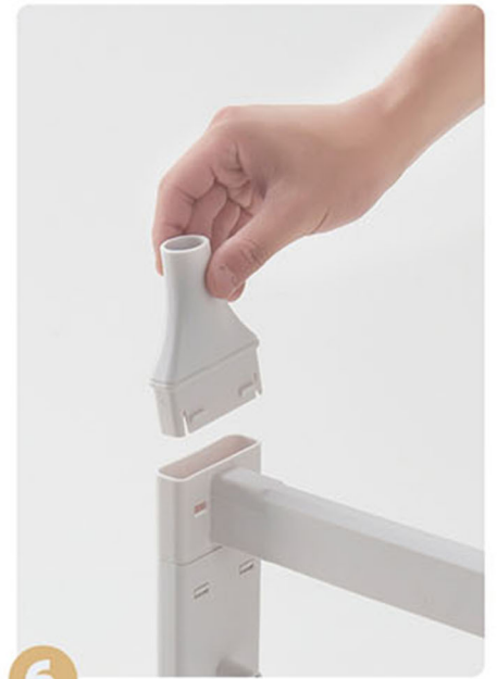
6 Mounting link pipe