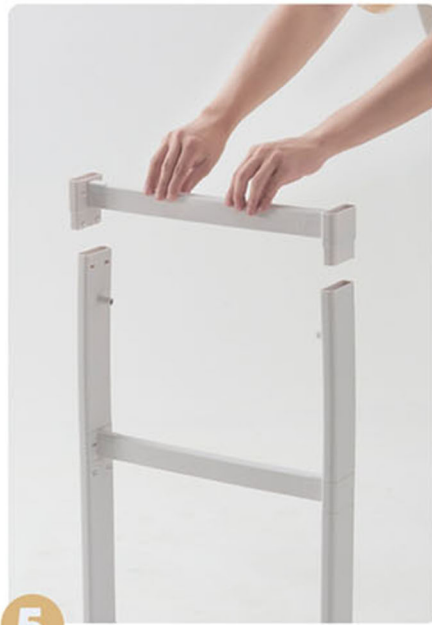
5 Install the cross bar