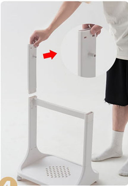
4 Install support frame with clamp