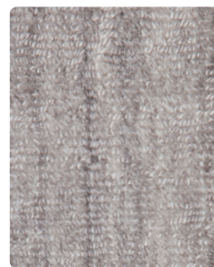
PU04 - BROWN