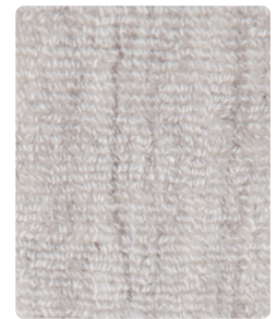
PU05 - LIGHT BROWN