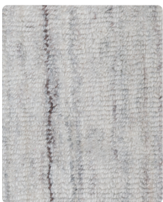
PU01 - TAUPE