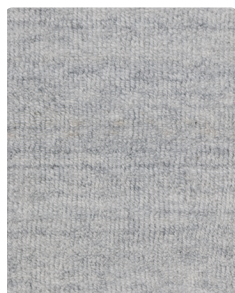
PU02 - LIGHT GREY