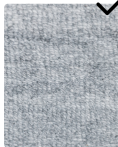
PU03 - GREY