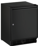
BLACK SOLID (LOCK)