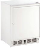
WHITE SOLID (LOCK)