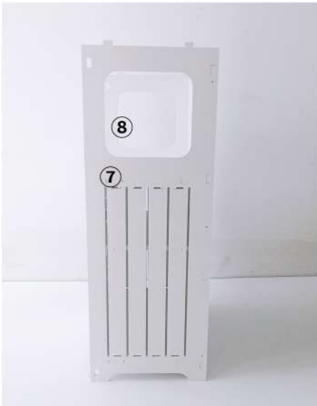
4. On both sides of the mount 7, 8 sides