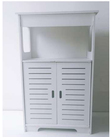
9. The installation is complete