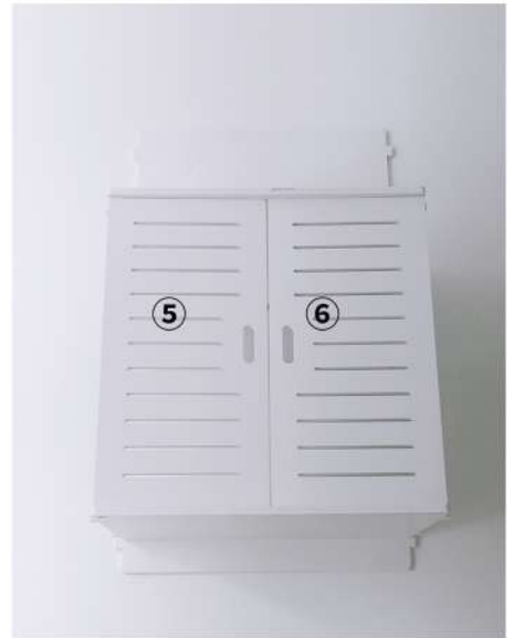
3. 5 and 6 boards