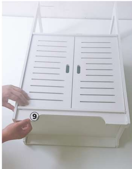
5. Loaded on 9th floor