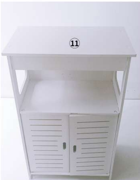
7. Cover 11 roof