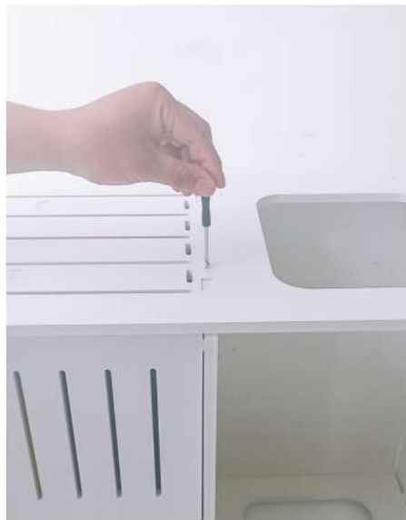
8. Screw on the screw