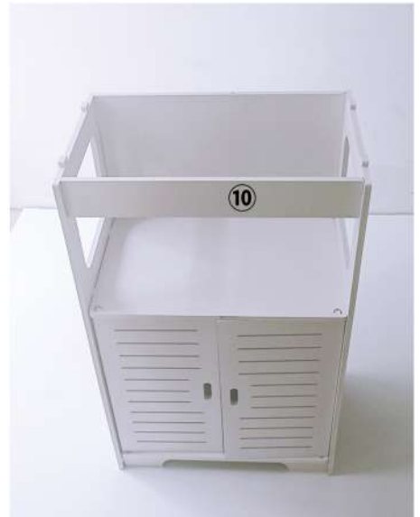
6. Number 10 on the board