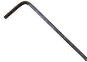
Allen Wrench (included)