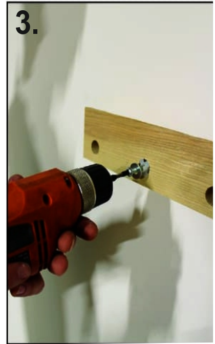
3. Secure the screws tight into the hole drilled in the wall with the help of drill