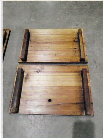
2 Side Pieces