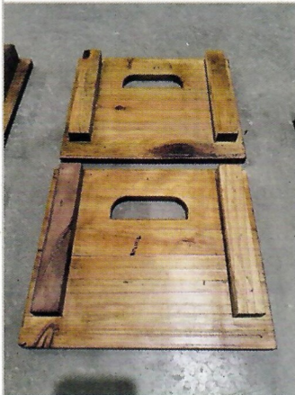
2 End Pieces