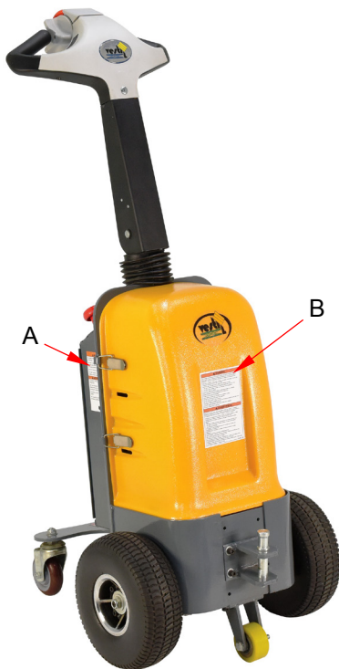
C: Label 656

The unit should be labeled as shown in the following diagram. However, label content and location are subject to change without notice so your product might not be labeled exactly as shown. Thoroughly photograph the labels applied to the unit when you first receive it as discussed in the Record of Normal Condition on p. 5. Replace all labels that are damaged, missing, or not easily readable (e.g. faded). Contact the technical service and parts department online at http://www.vestilmfg.com/parts_info.htm to order replacement labels. Alternatively, you may request replacement parts and/or service by calling (260) 665-7586 and asking the operator to connect you to the Parts Department.