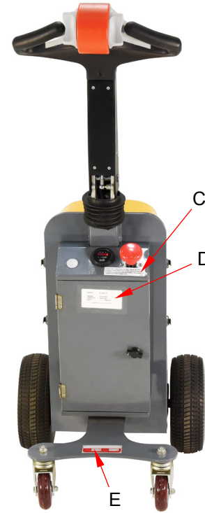
E: Metal data tag