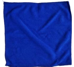
Cleaning Cloth 1x