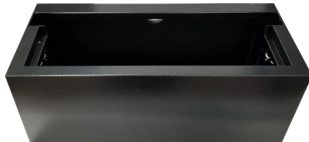
Fountain Base 1x