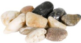
Bag of Rocks 1x