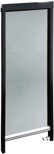
Fountain Top 1x