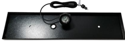
Fountain Tray with Light 1x