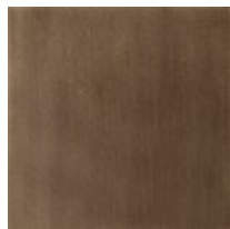
Brushed Gold Paint