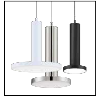
PENDANT ACCESSORY (Sold Separately, Fixture NOT included)

Job Name : _____ Job Type : _____ Quantity : _____ Comments : _____