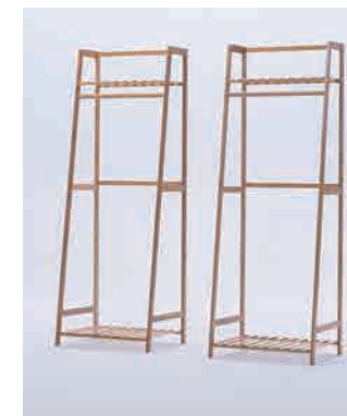
⑧ Repeat steps 1-7 for the other rack.