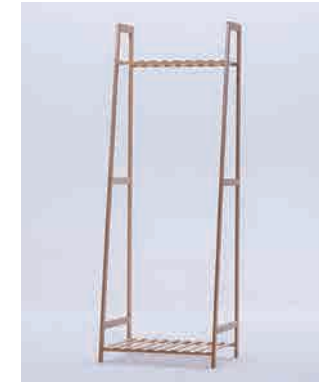
⑤ Stand up the Rack.