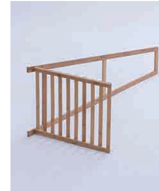
② Secure with Screws (k).

© 2020 - 2025 by Pundarika LLC - MoNiBloom.com