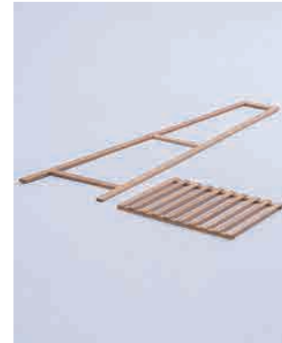
① Position Frame (a) and Large Panel (e) as picture shown.

© 2020 - 2025 by Pundarika LLC - MoNiBloom.com