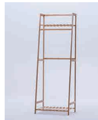
⑦ Install Top Hanging Rod (b) with Screws (k).