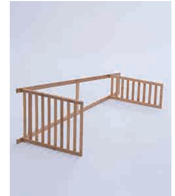
③ Position and Secure Small Panel (d) with Screws (k).