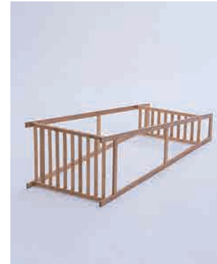
④ Install another Frame (a).