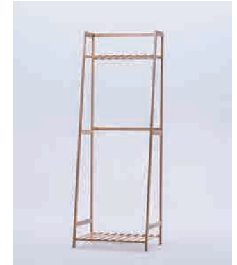
⑥ Position and Secure Back Slats (c) with Screws (k).