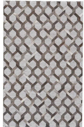
STEEL / STORM