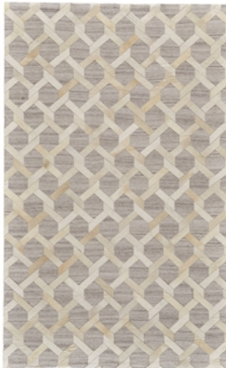
IVORY / SILVER