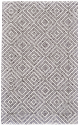
IVORY / SLATE