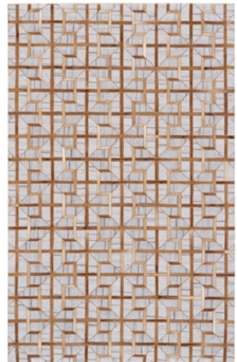
SUDAN / SLATE