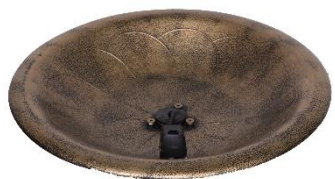
Fountain Basin (Pump Preinstalled)