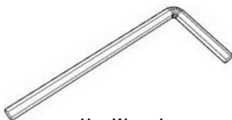
Hex Wrench 1 pc.