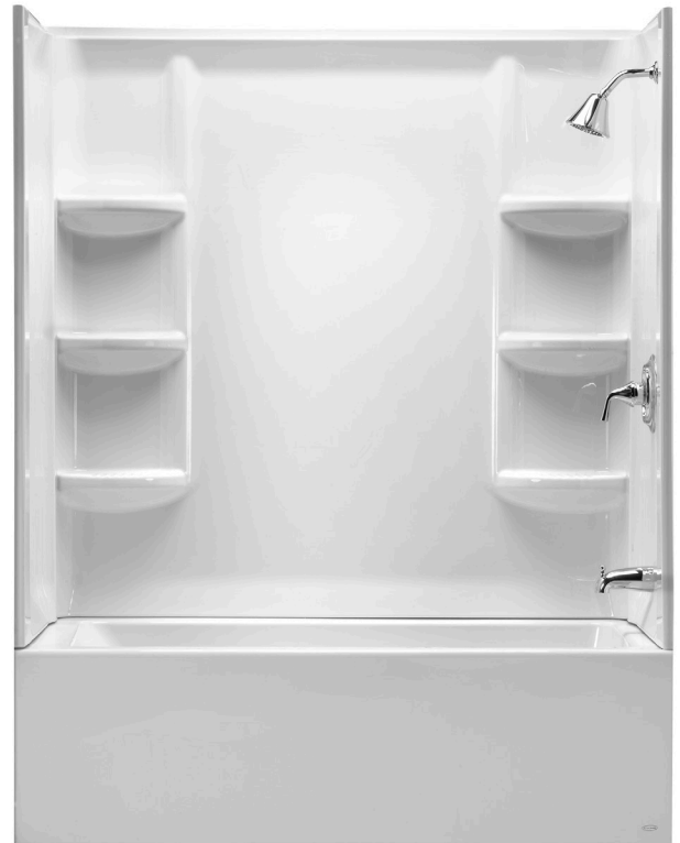
Studio Bathing Pool shown with 2946.BW Studio wall set

SEE REVERSE FOR ROUGHING-IN DIMENSIONS AND PRODUCT SPECIFICATIONS