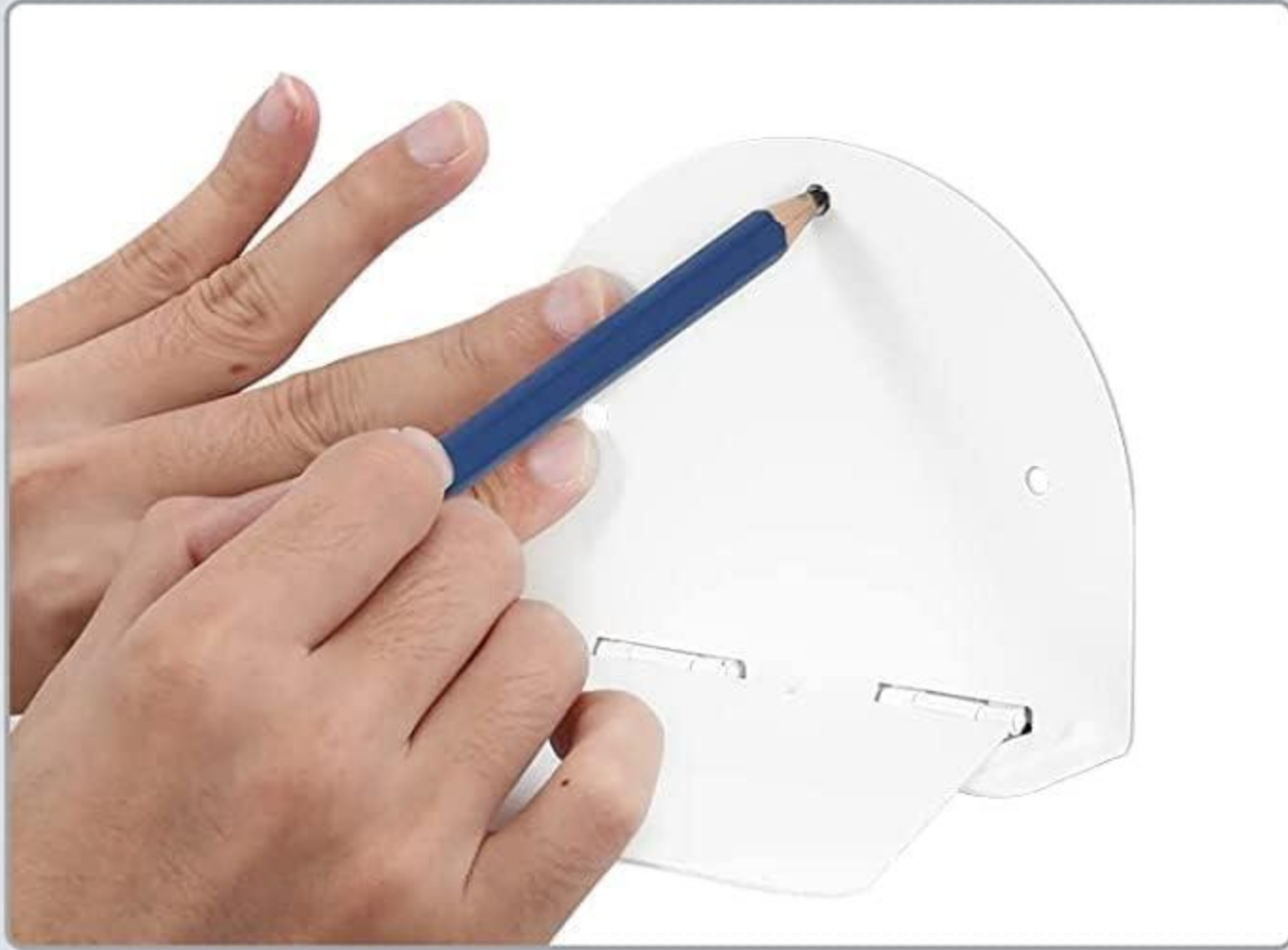
Step1: Marking the hanging holes on the wall for the bookshelves