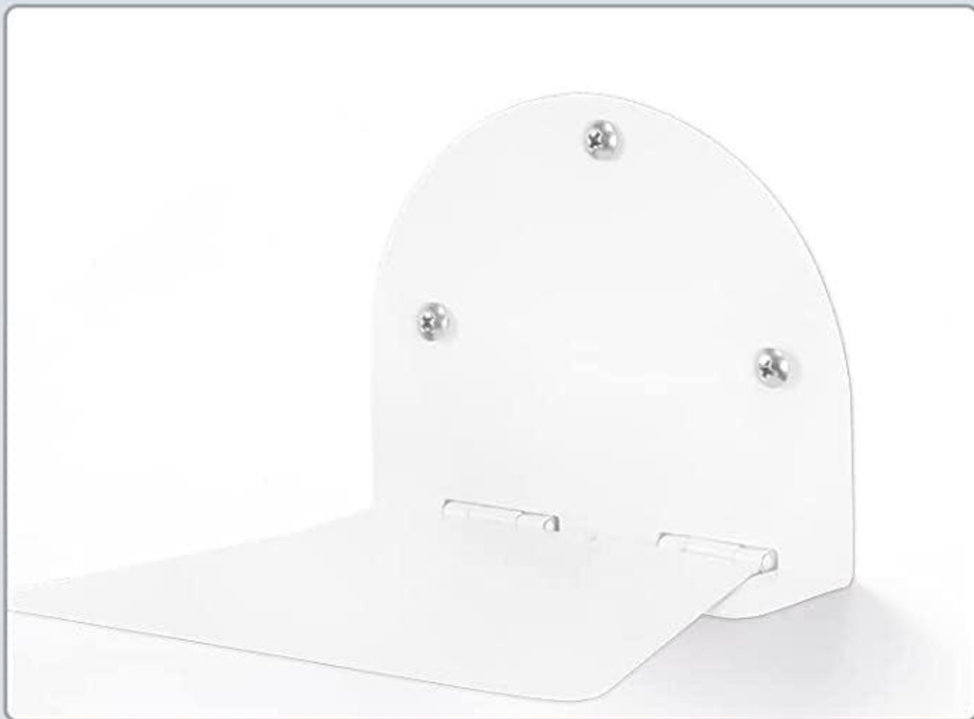
Step3: Put the wall anchor into the hole and install the screws