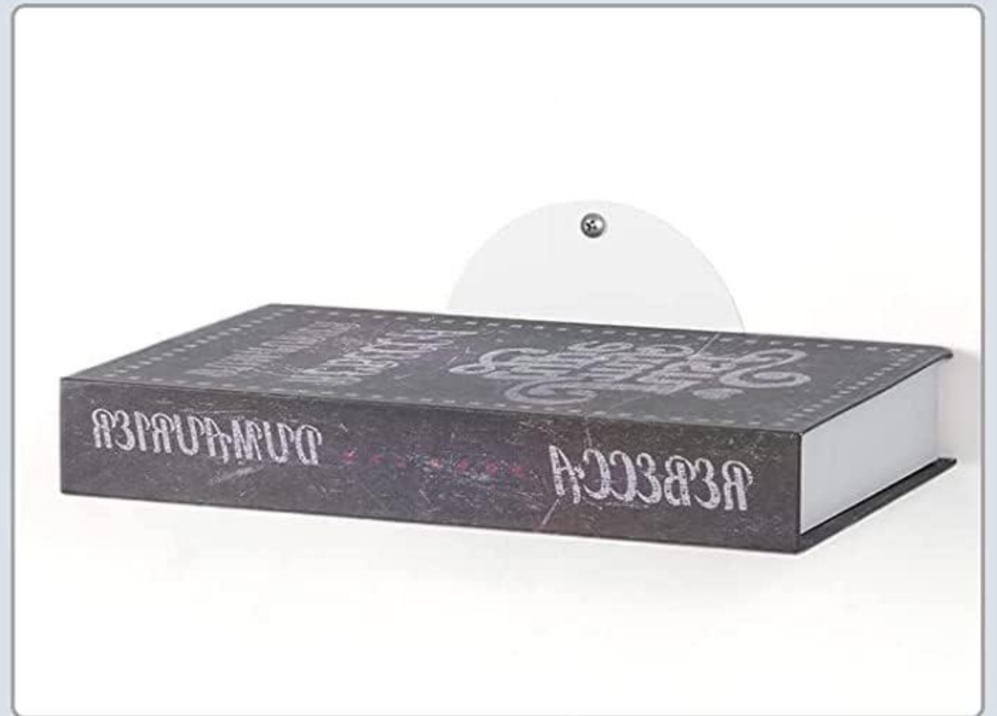
Step4: Finish the installation