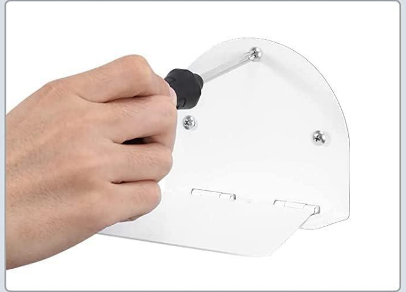
Step2: Drilling holes in the marker points