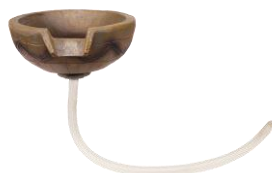
Fountain Top 1x