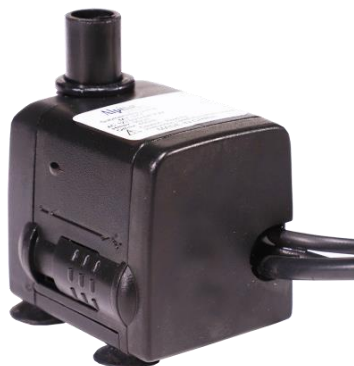
Fountain Pump 1x