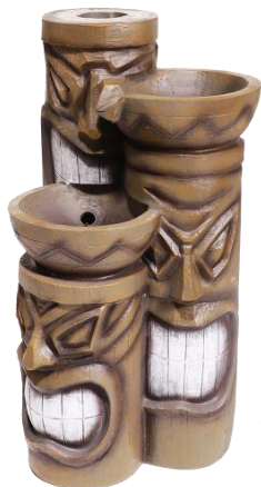
Fountain Base 1x