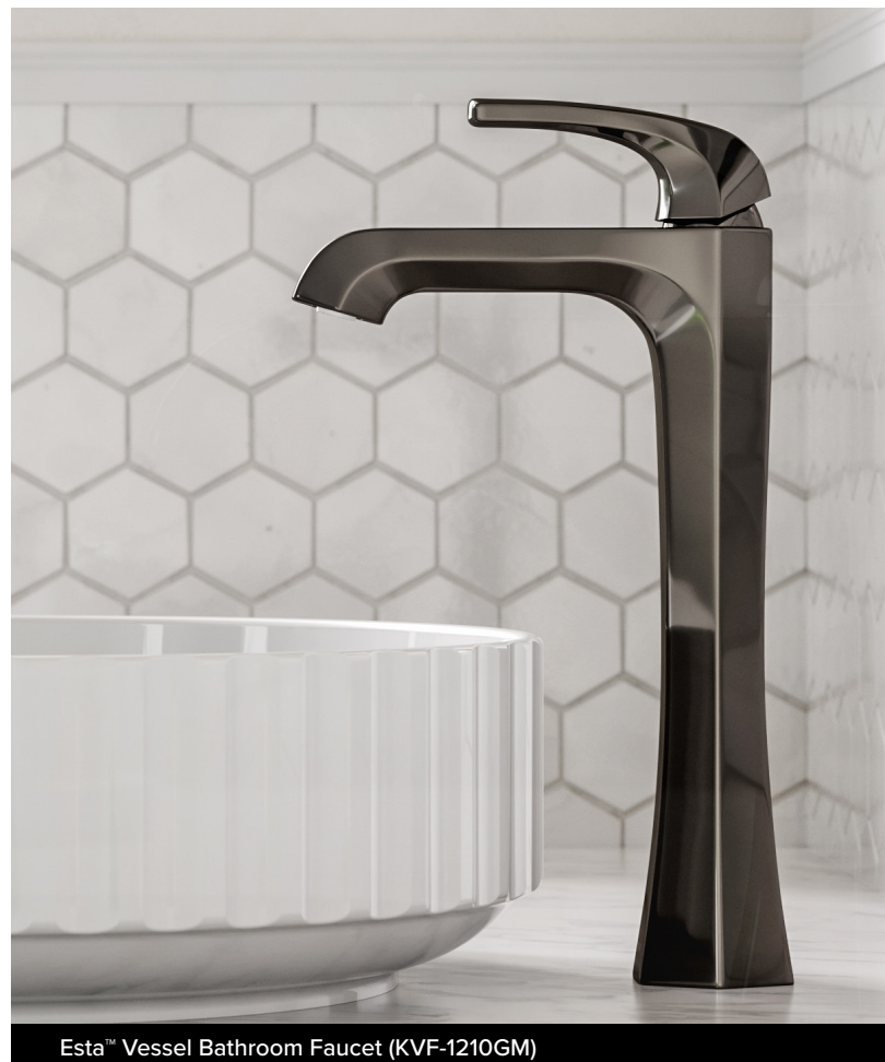
Esta™ Vessel Bathroom Faucet (KVF-1210GM)