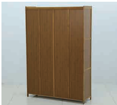
⑫ Position Top Slat (g) as picture shown, secure it with Large Screws (o) and Long Screw (n) from the top.