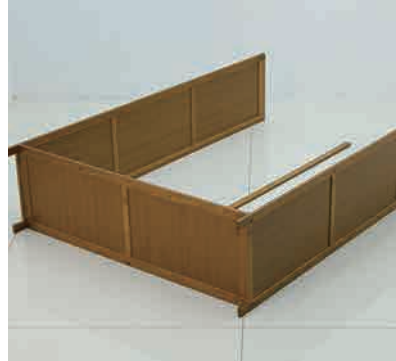
③ Position and secure Back Support Slat (e) with Large Screws (o).