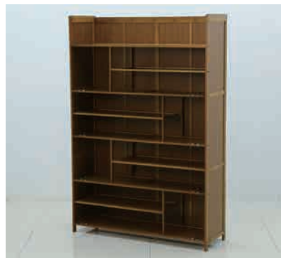
⑬ Flip around the frame.