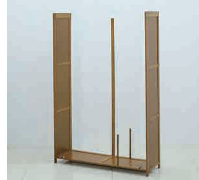
④ Install 2 Support Slats (k) with Large Screws (o) as picture shown.