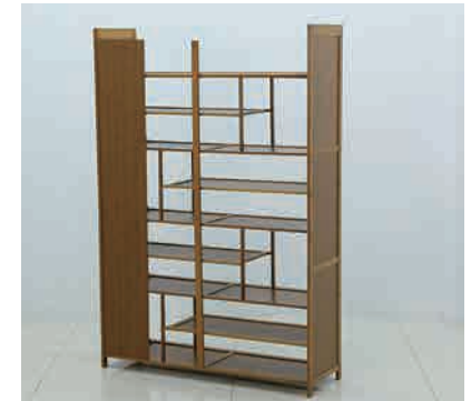
⑩ Flip around the frame , insert Back Panel (c) along the groove.