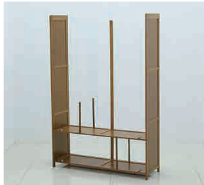
⑥ Install 2 more Support Slats (k) on the Panel from Step 5 with Large Screws (o).