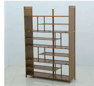
⑨ Install Top Panel (j) with Large Screws (o).