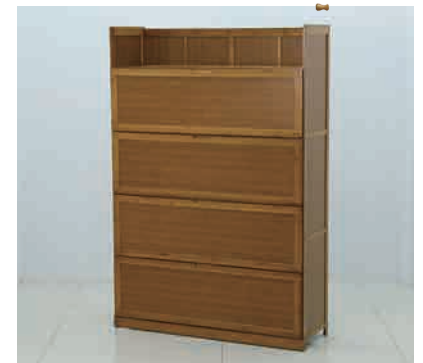
⑮ Install Bottom Cover (f) with Medium Screws (p).