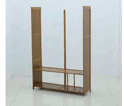
⑤ Install Panel (m) on the Support Slats (k) with Large Screws (o).