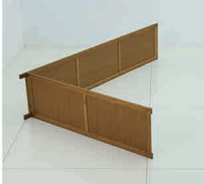
① Position and secure Left Side Panel (a) and Bottom Panel (h) with Large Screws (o). Align the groove on both Panels.

The assembly instructions may vary depending on the number of tiers