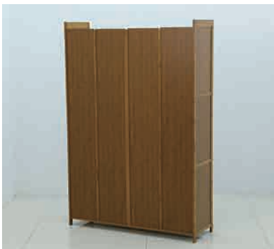
⑪ Insert Back Panels (d) then follow Step 10 to insert all the Back Panels (c).