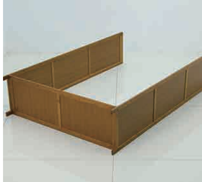
② Install Right Side Frame (b) with Large Screws (o).