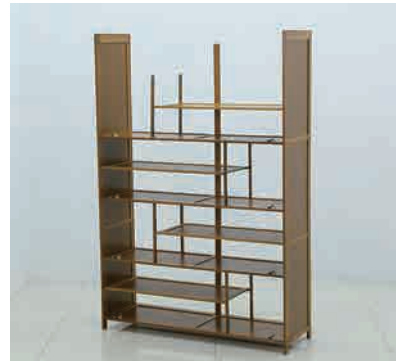
⑧ Install Small Panels (l) as picture shown with Large Screws (o).