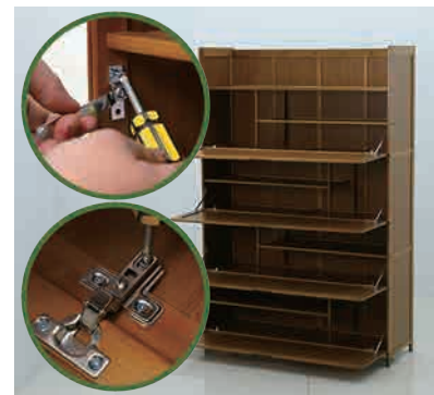
⑭ Install all the Door Panels (i) and Hinges (r) with Small Screws (q).