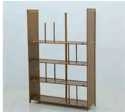
⑦ Repeat Step 5 and 6 until all the Support Slats (k) are used.